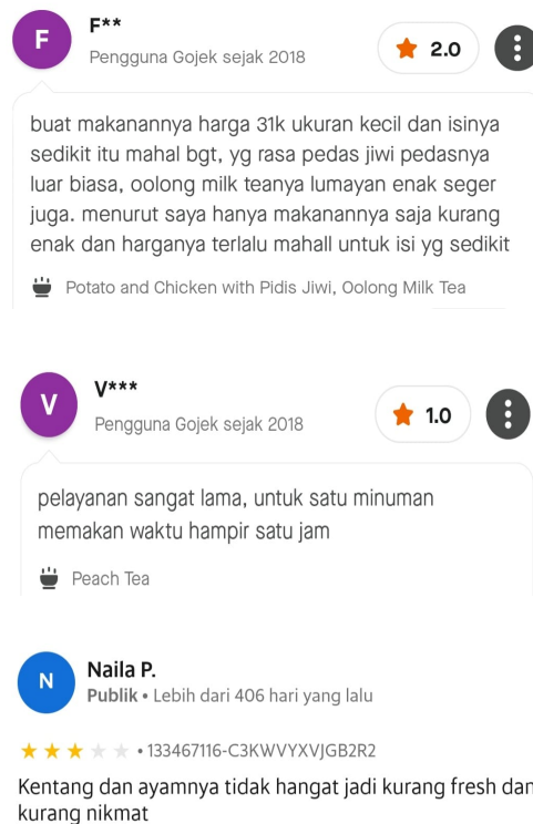
Figure 3. Costumer Complaints

Direct complaints that have been received are in the early months of the Menantea Purwokerto opening. Many customers complained verbally because of the long wait for orders to be processed, and several forms of complaints received through digital media such as prices that according to customers were still too expensive, the snacks served were not warm, there is a discrepancy between the product sent and what the customer ordered, an error in inputting the price of the product, the quality of the taste and the drink leaking because the seal is not tight. The followings are sample of digital complaints: