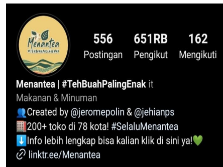
Figure 1. Menantea Instagram Account

branches in 78 cities across Indonesia, according to the Instagram account @menantea.toko.